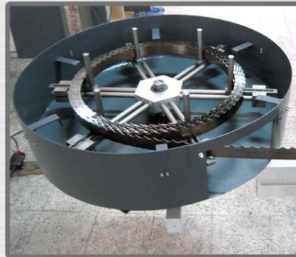
Optional Band coiler and uncoiler