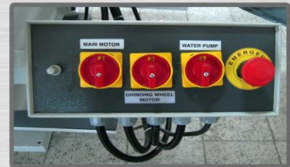
On/Off Switch Control Panel