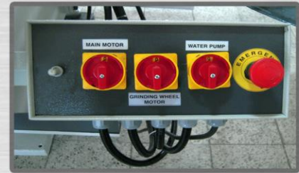
On/Off Switch Control Panel