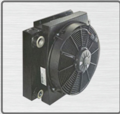
Optional Cooling System